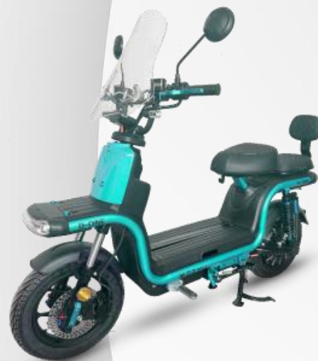
● Scuba blue